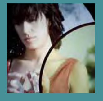
New violin concerto: Mambo, Blues & Tarantella