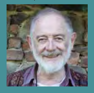
Van der Aa The Book of Disquiet: music theatre premiere