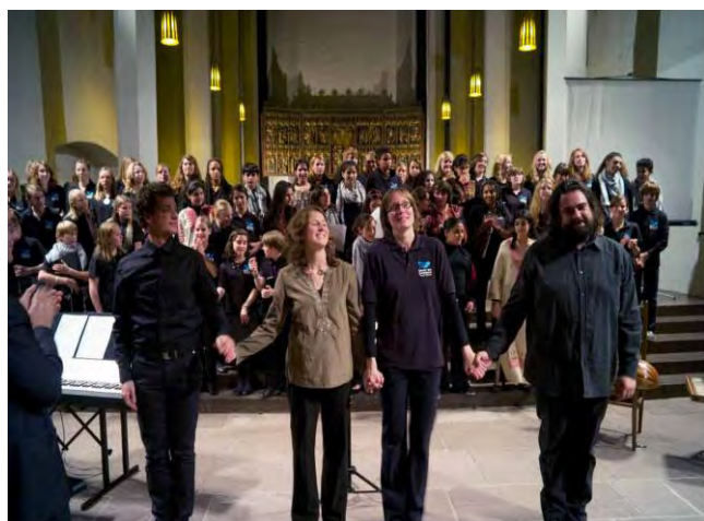
The Choirs from Palestine and Germany in the Concert

The program was generously facilitated by the Anna-Lindh Foundation and the Heinrich-Böll Foundation Schleswig-Holstein .