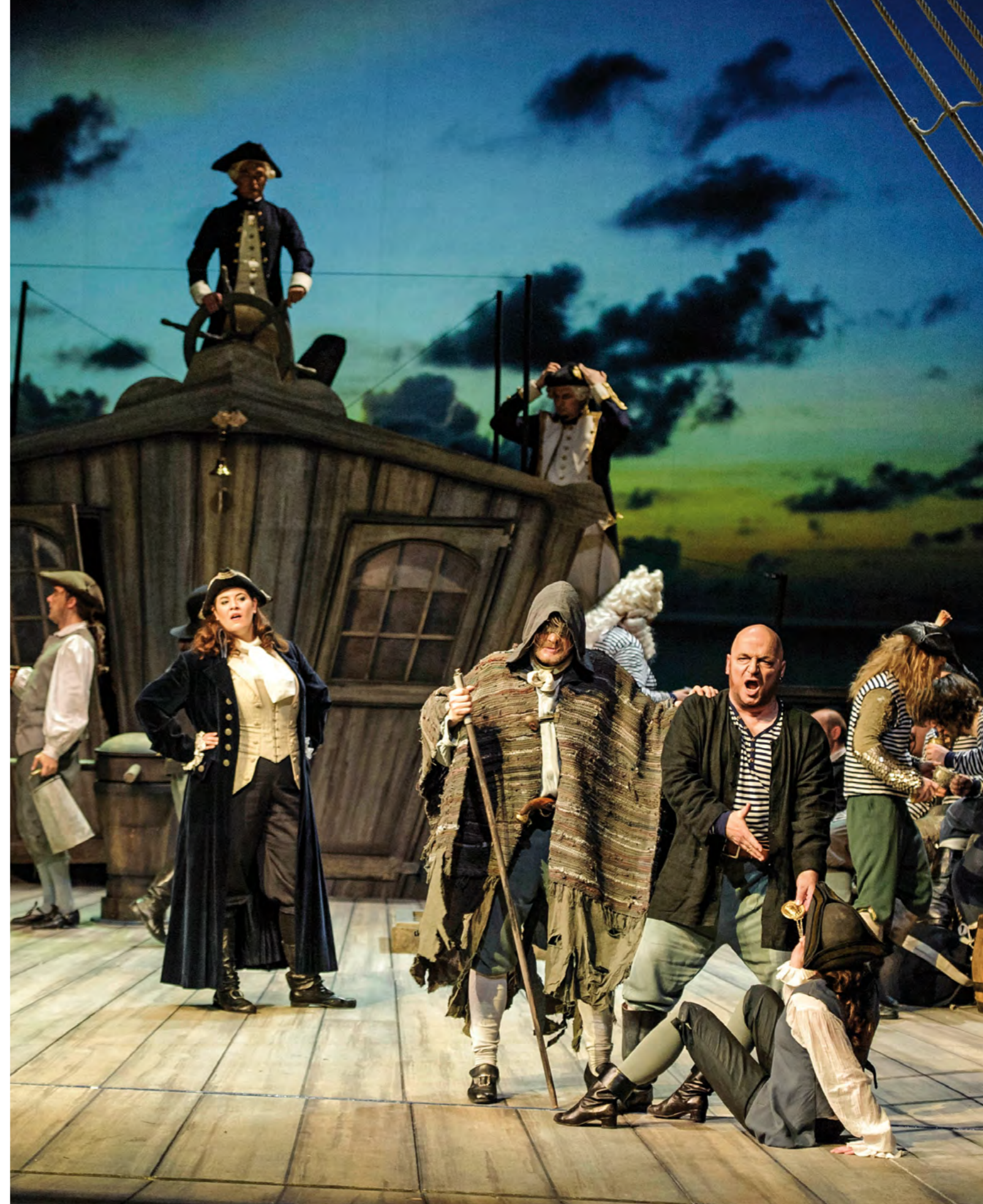
TREASURE ISLAND Erfurt, 2013