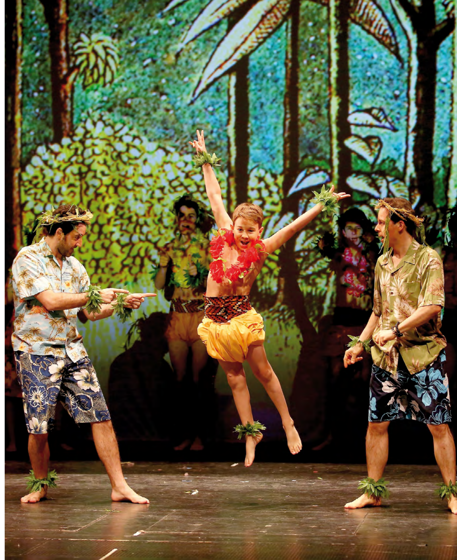
ERWIN, THE NATURAL TALENT Vienna, 2014