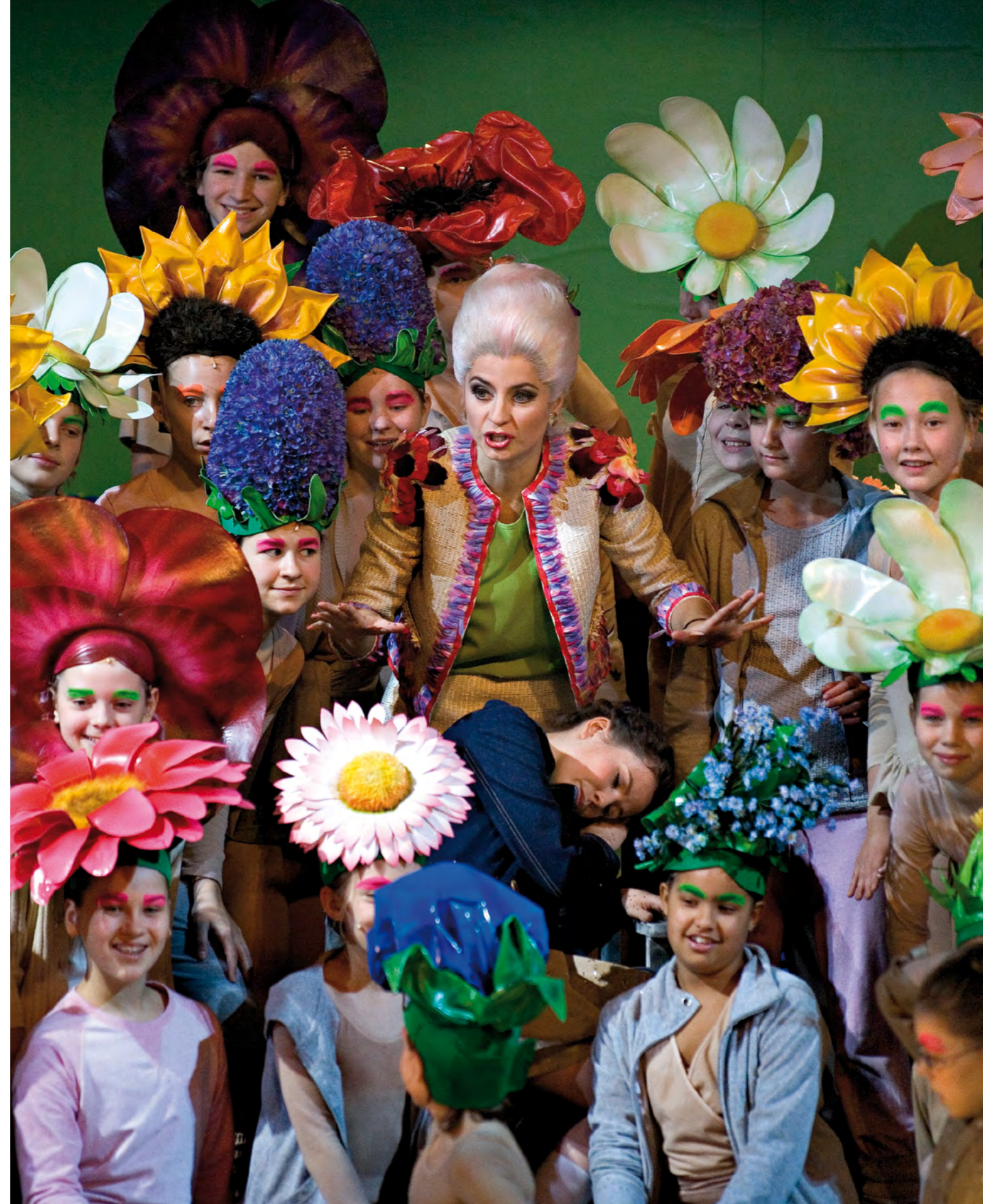
THE SNOW QUEEN Berlin, 2010