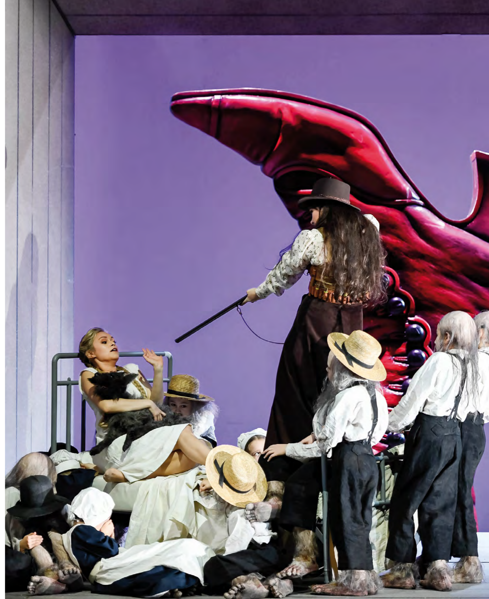
THE WIZARD OF OZ Zürich, 2016