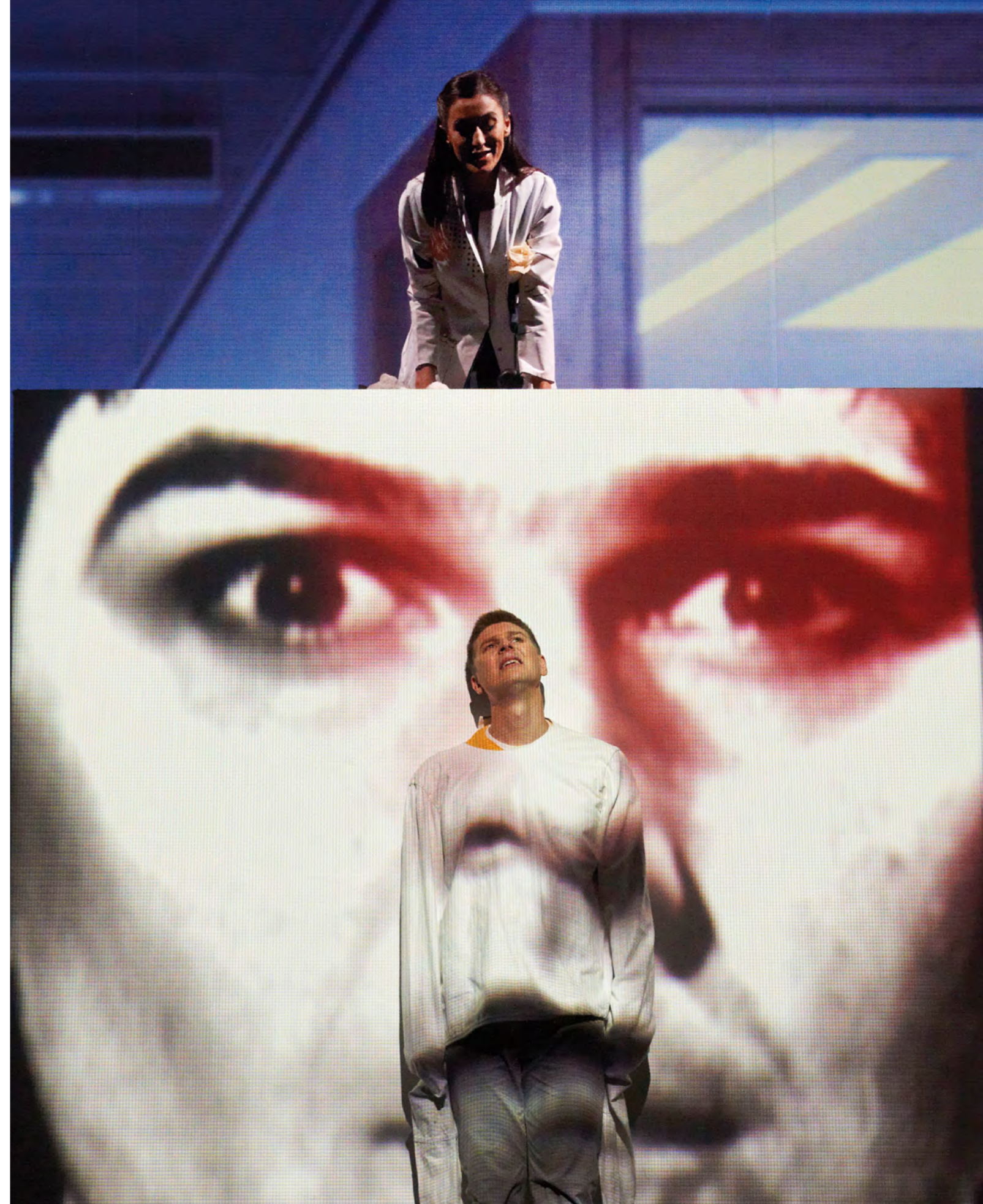
THE RAGE OF LIFE Stuttgart, 2010