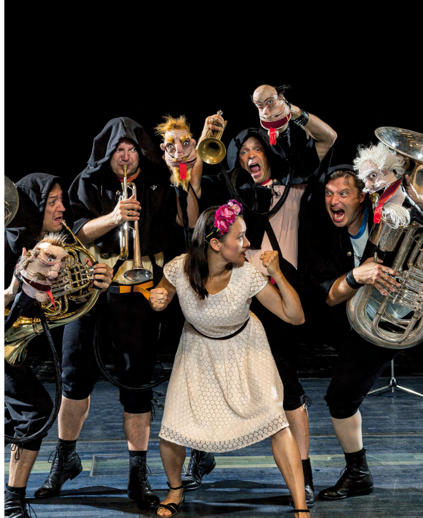
ROBIN HOOD – TOO GOOD TO BE TRUE Lucerne, 2013