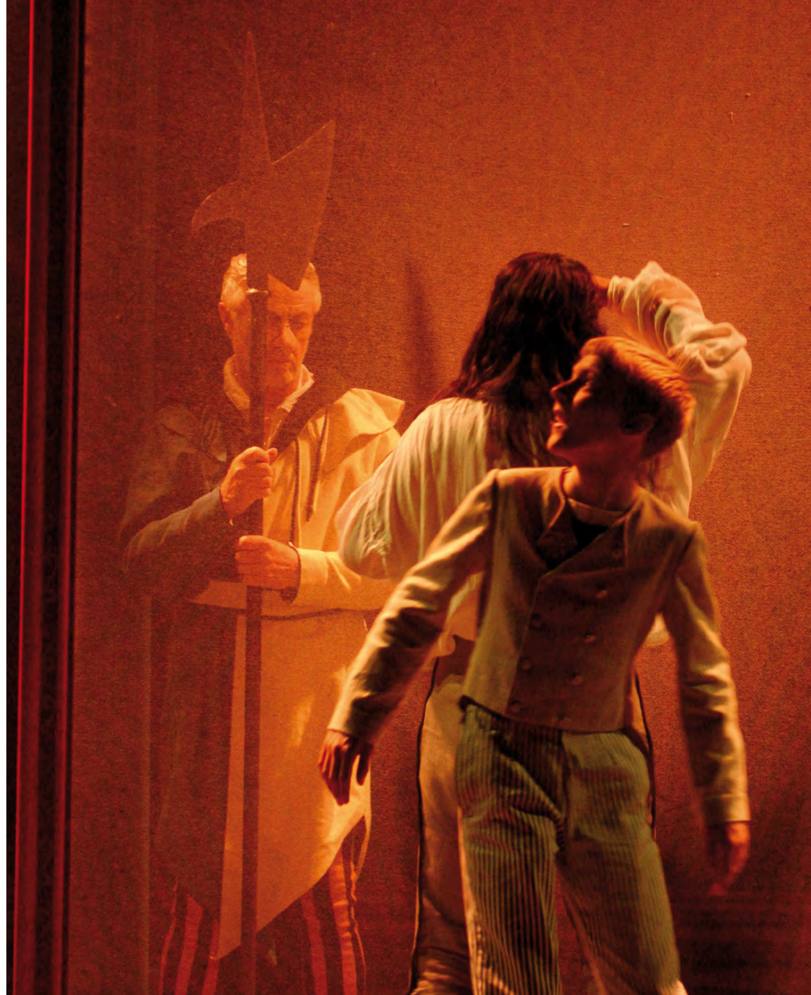
THE THREE RIDDLES Bonn, 2004