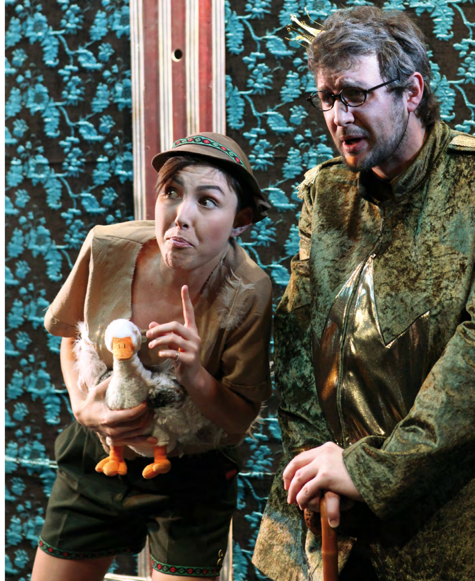
THE GOOSE GIRL Vienna, 2010