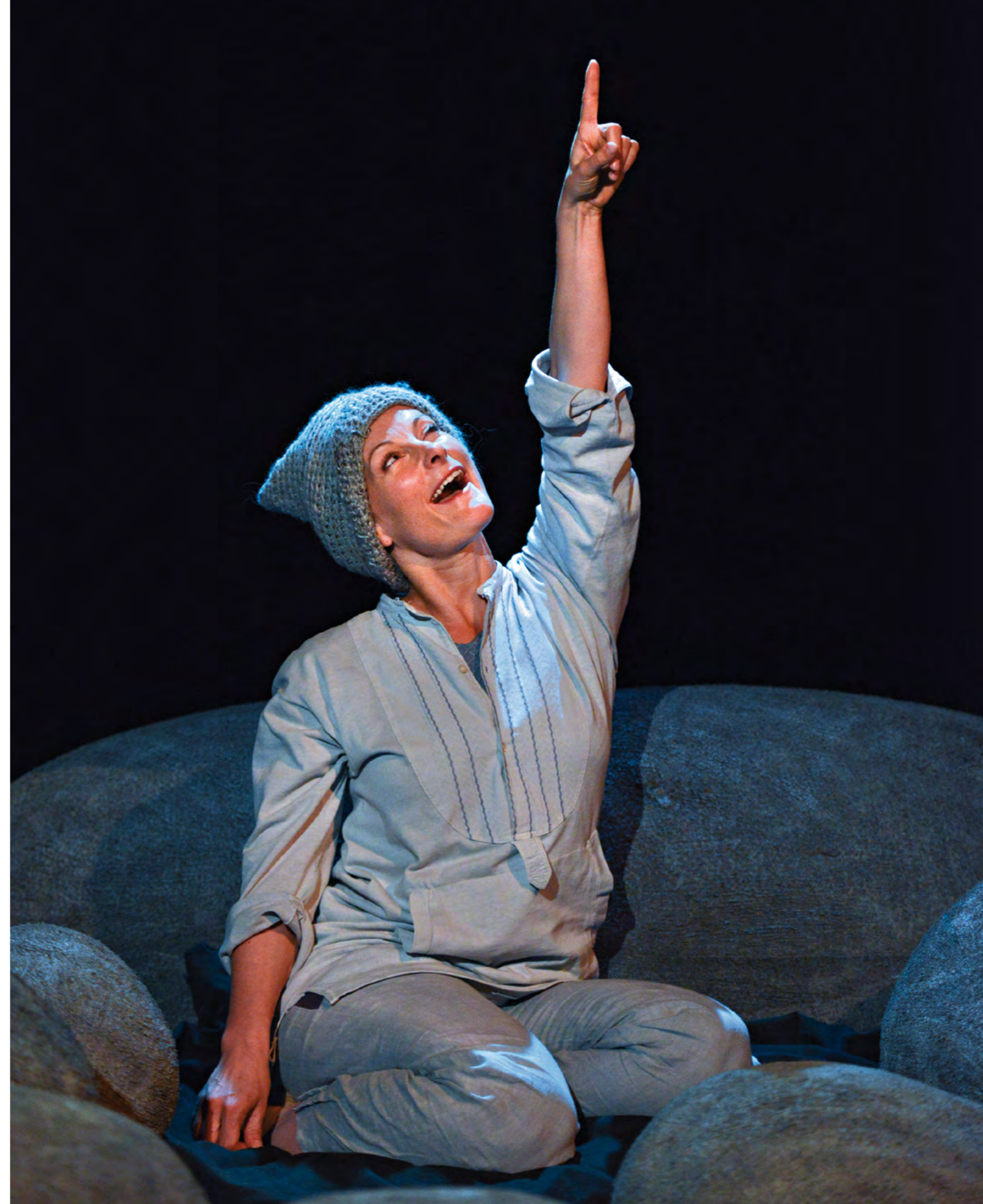
GOLD! Mannheim, 2014