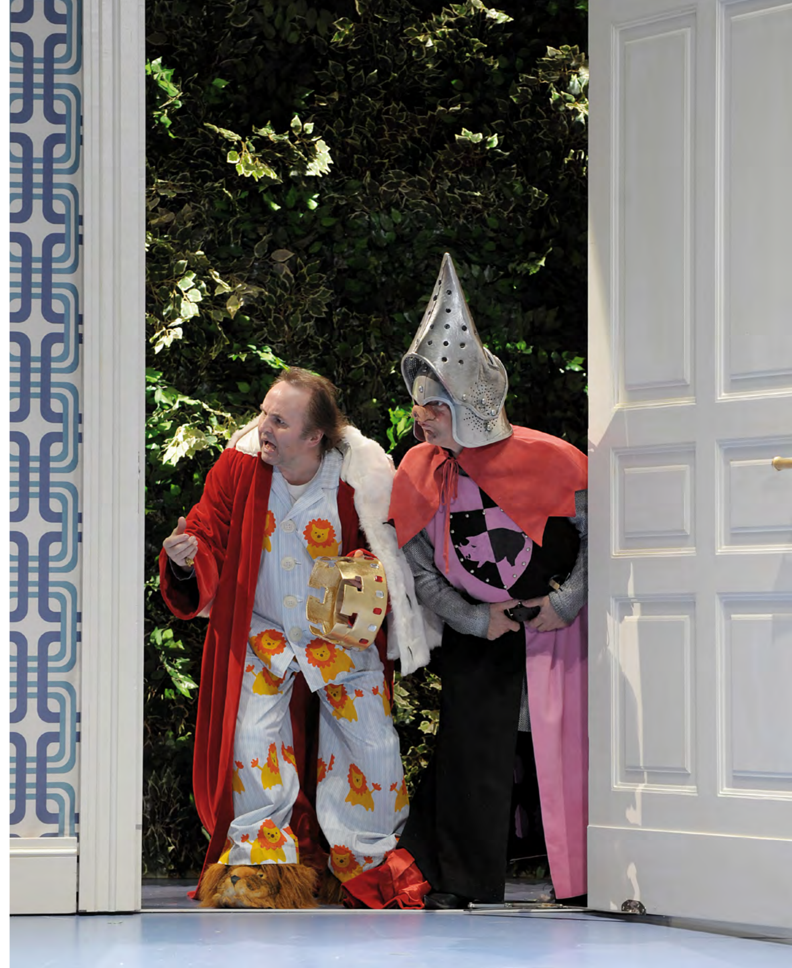
ROBIN HOOD Berlin, 2008