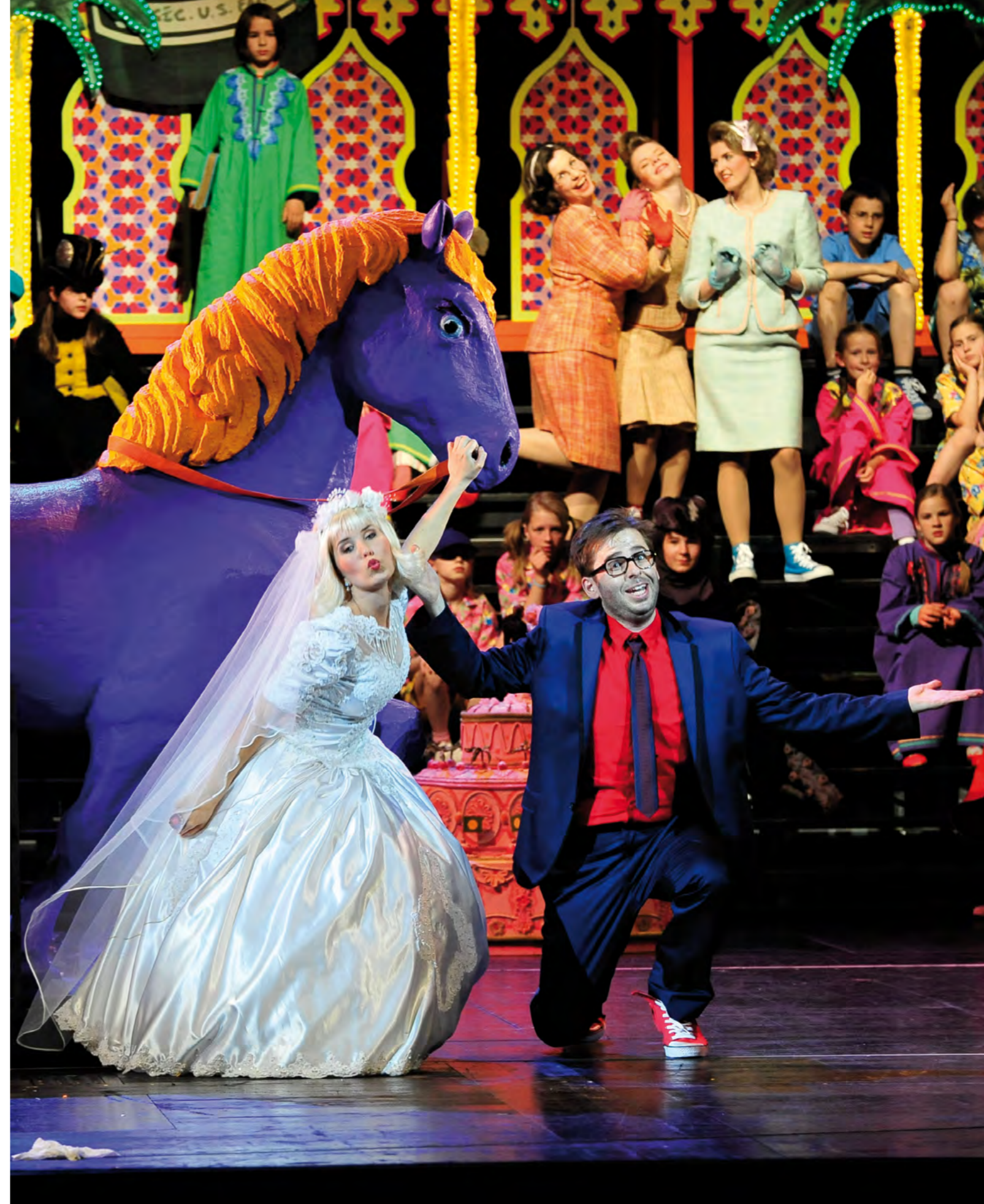
THE ARABIAN PRINCESS Leipzig, 2011