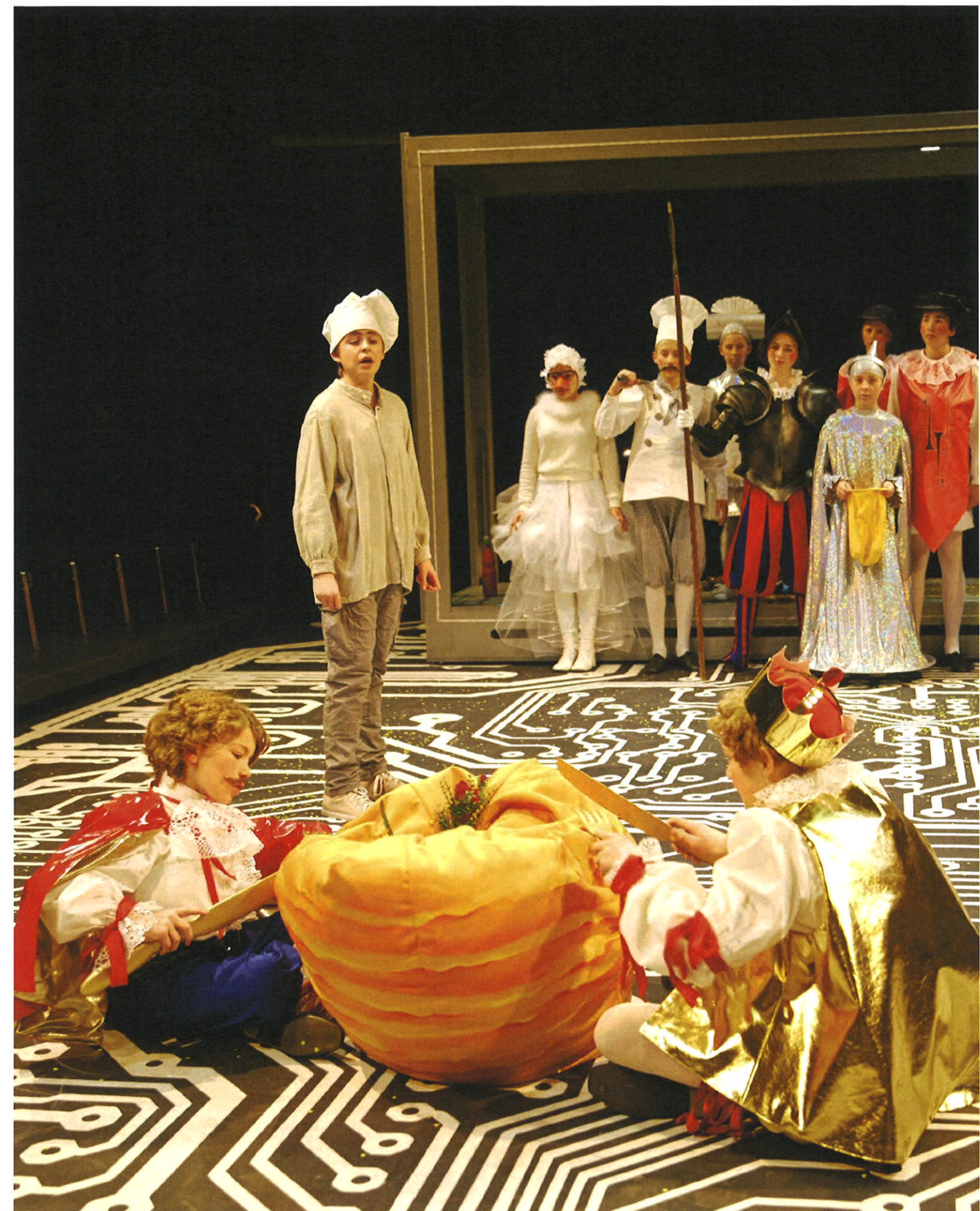
THE DWARF'S NOSE Hamburg, 2014