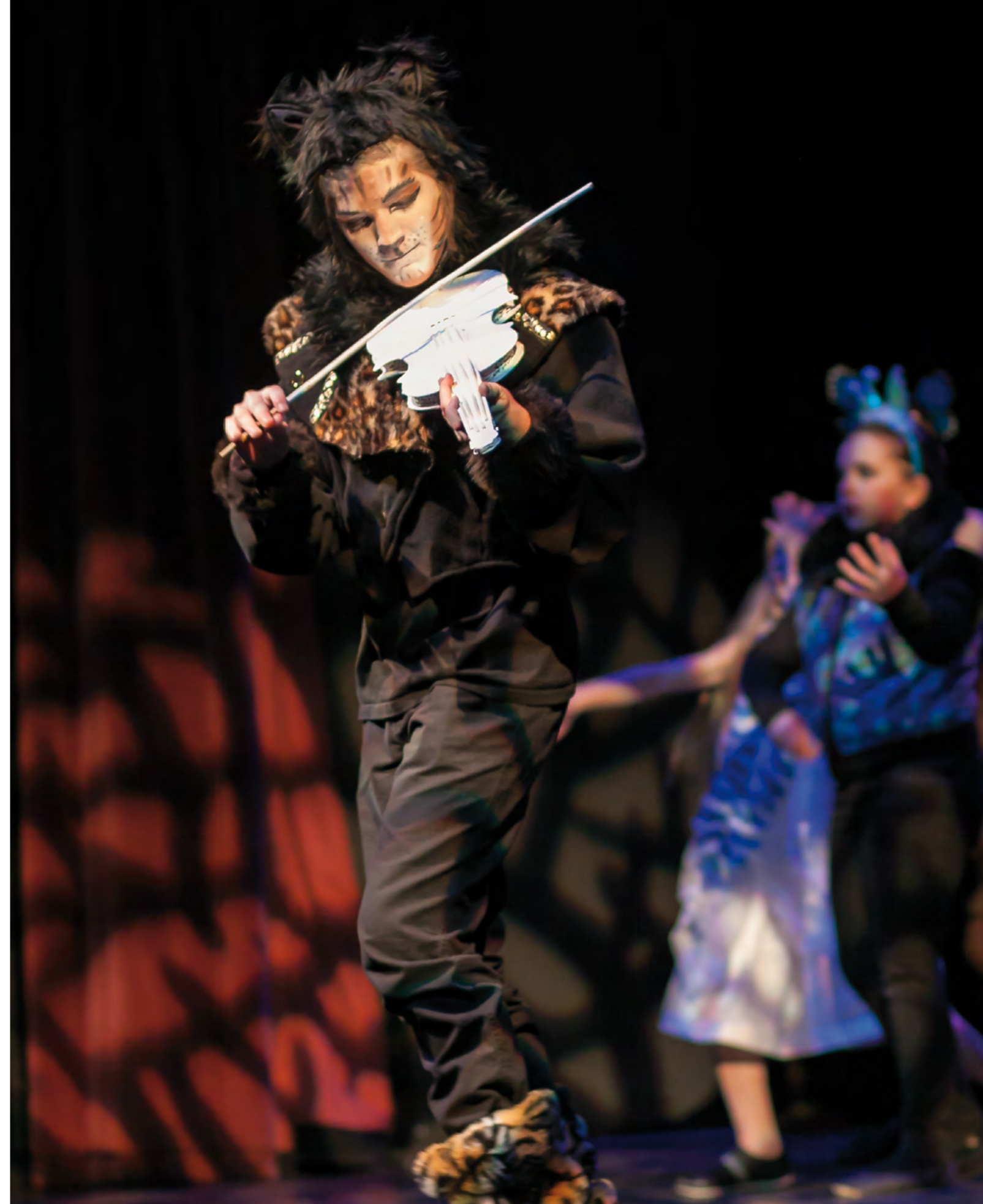
TOMCAT MOSHE AND THE MAGIC BOW Gelsenkirchen, 2011