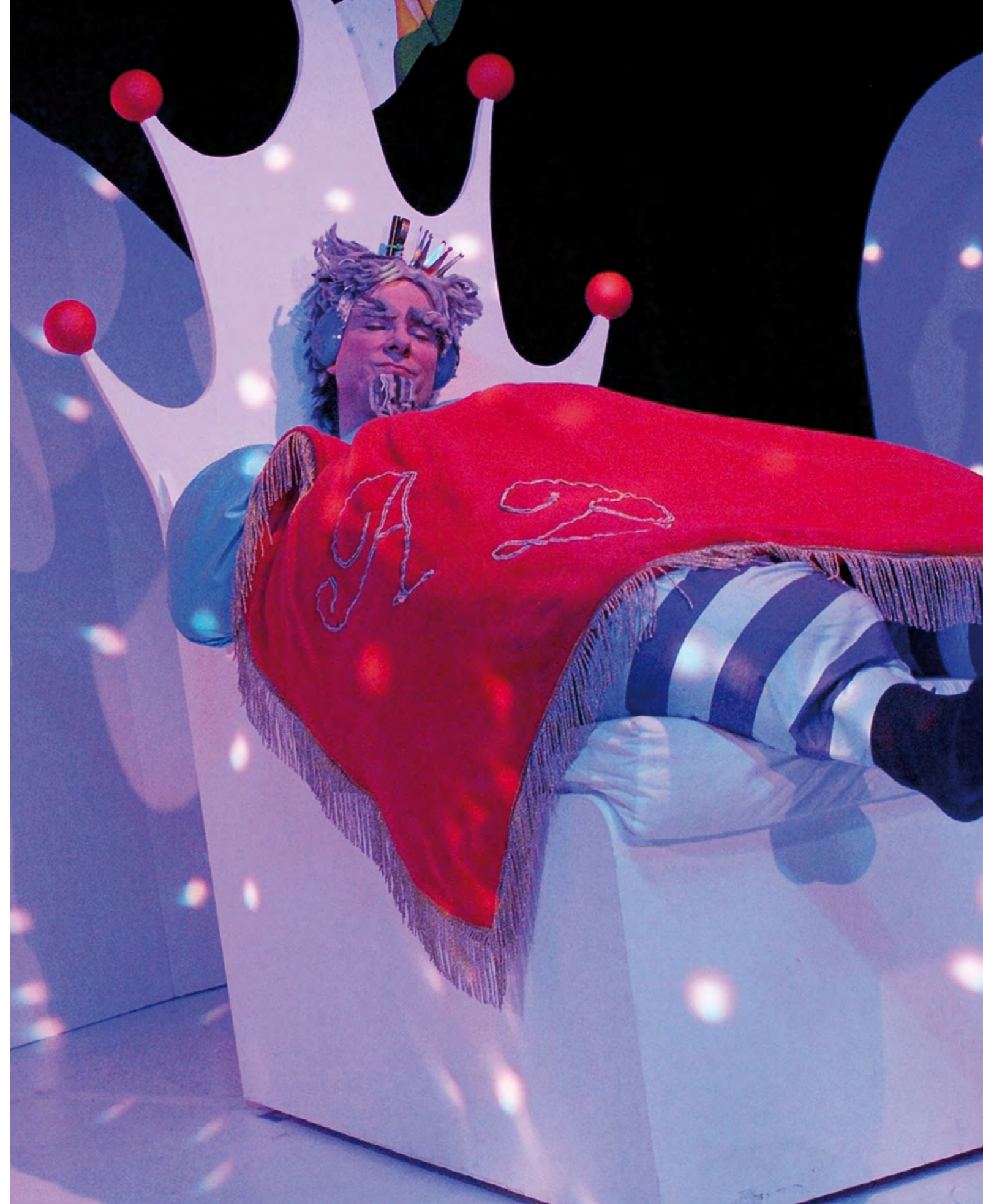
THE INCREDIBLE SPOTZ Würzburg, 2010