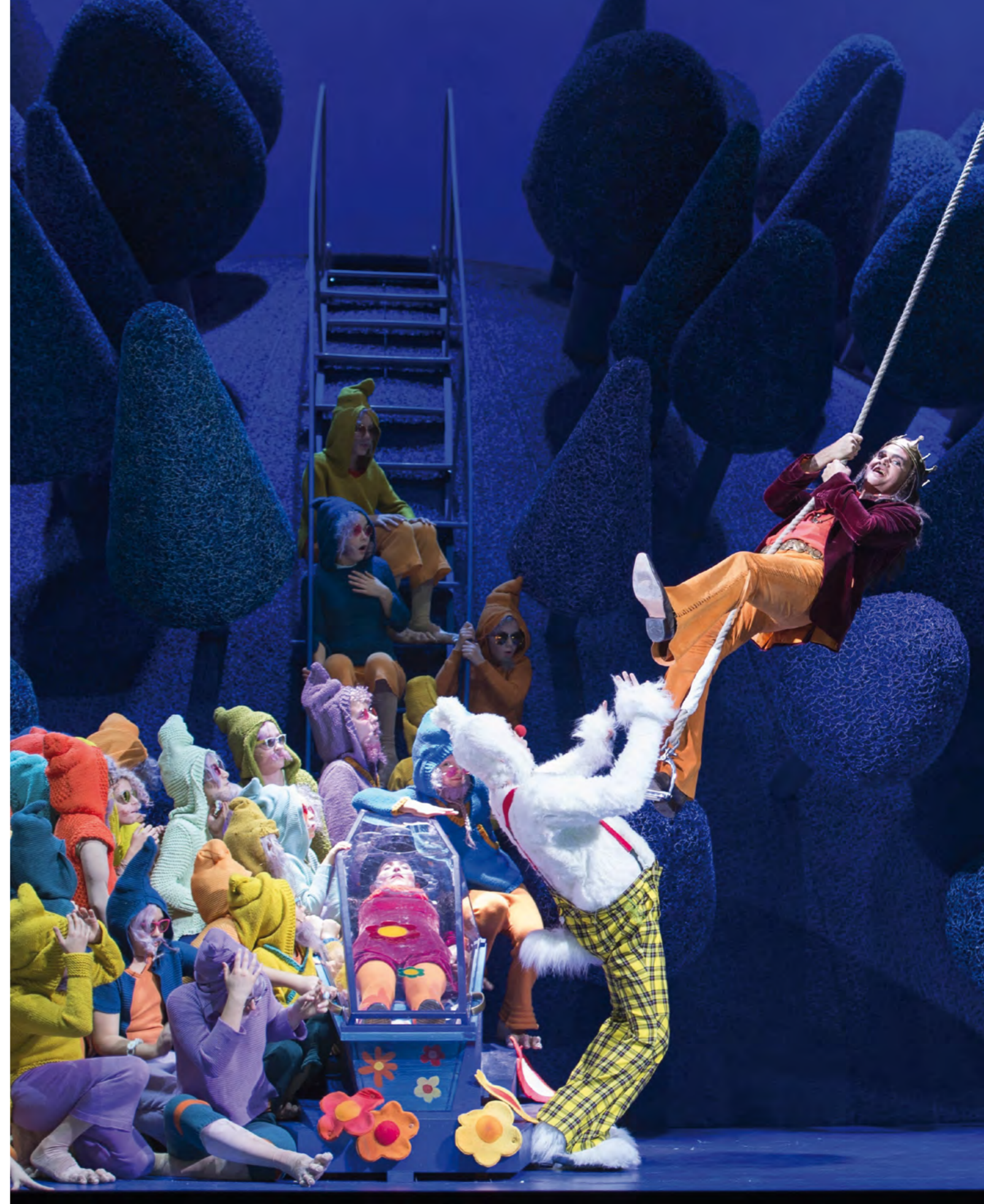
SNOW WHITE AND THE 77 DWARFS Berlin, 2015