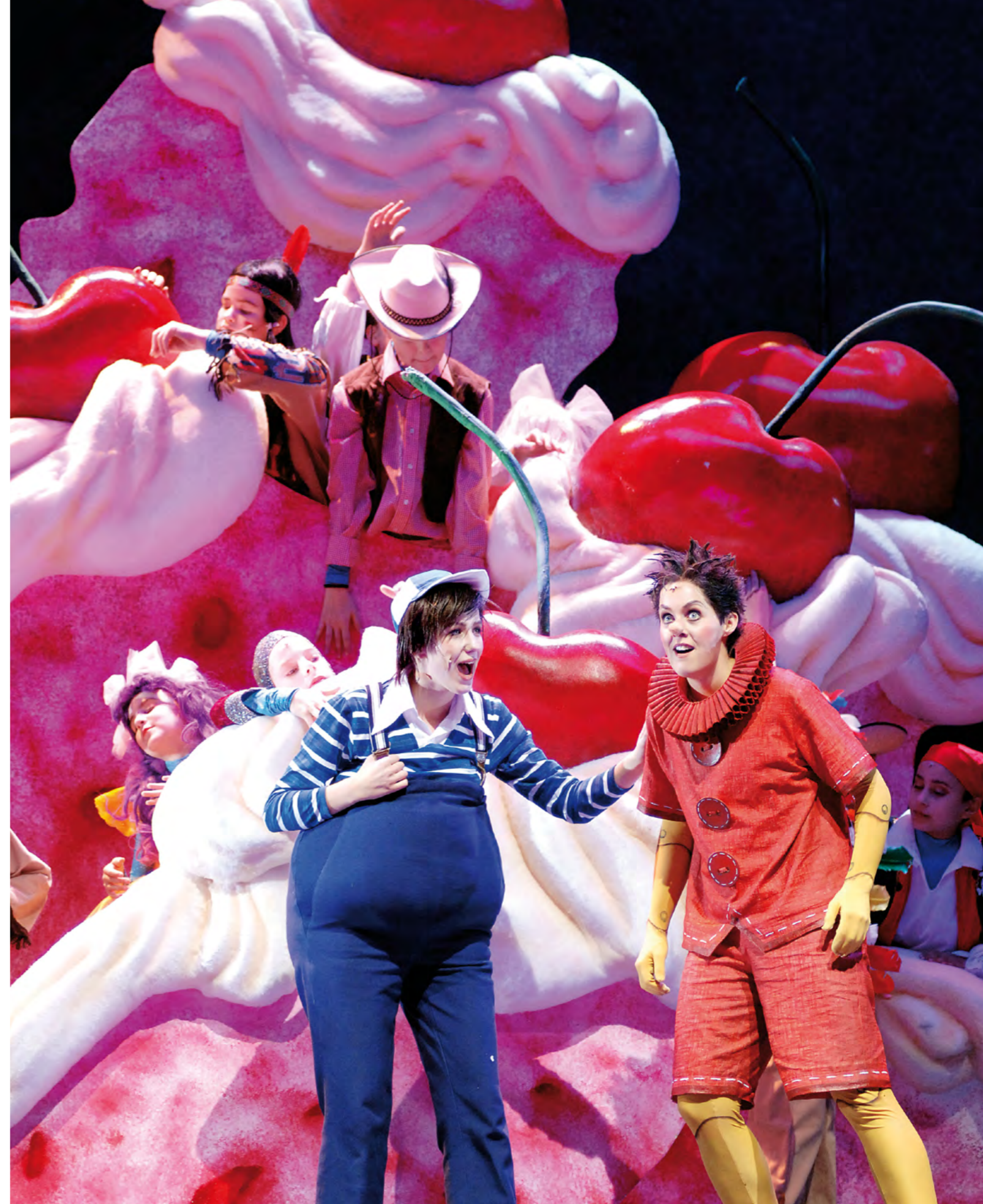
PINOCCHIO Berlin, 2006