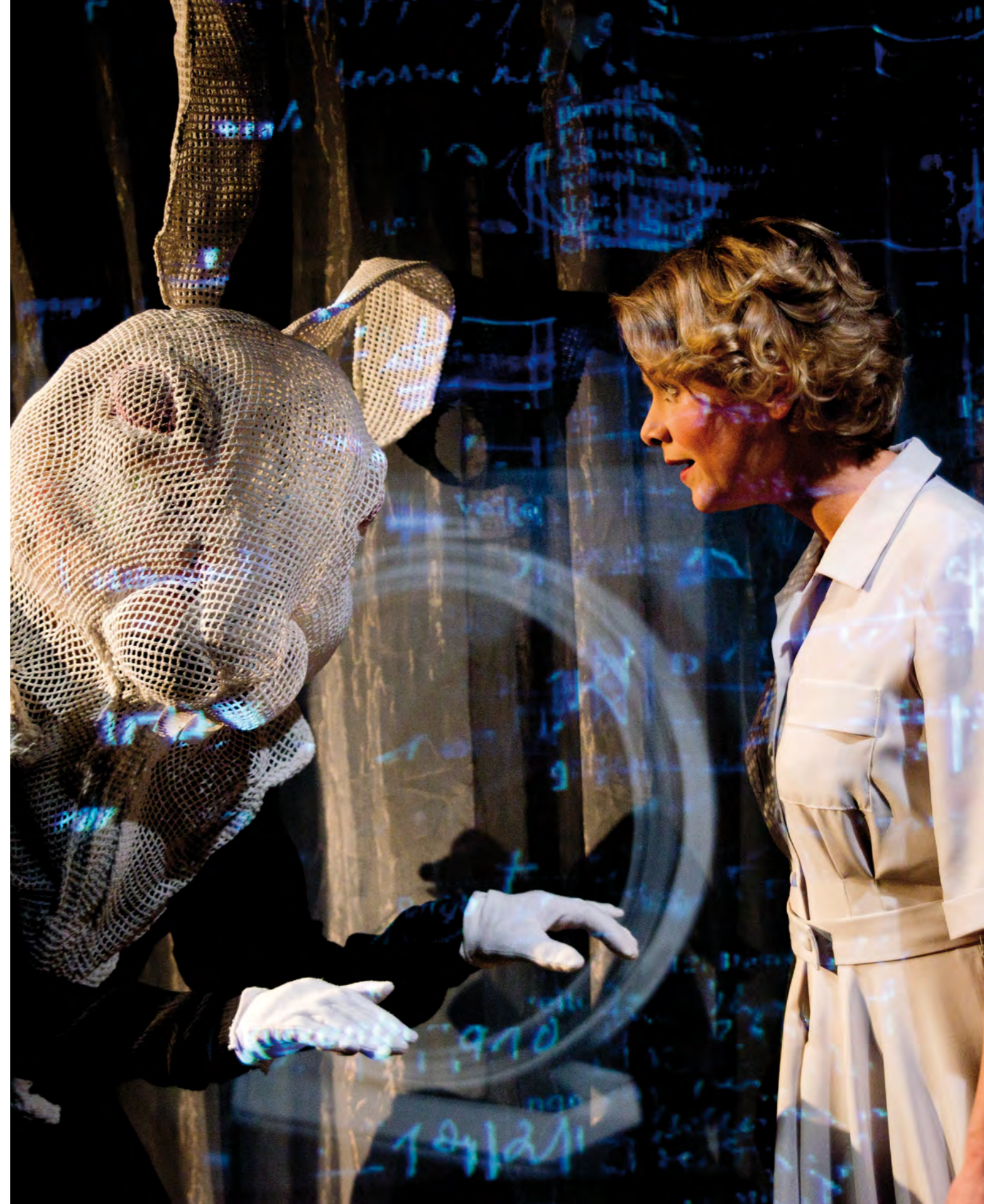
WONDERLAND Würzburg, 2013