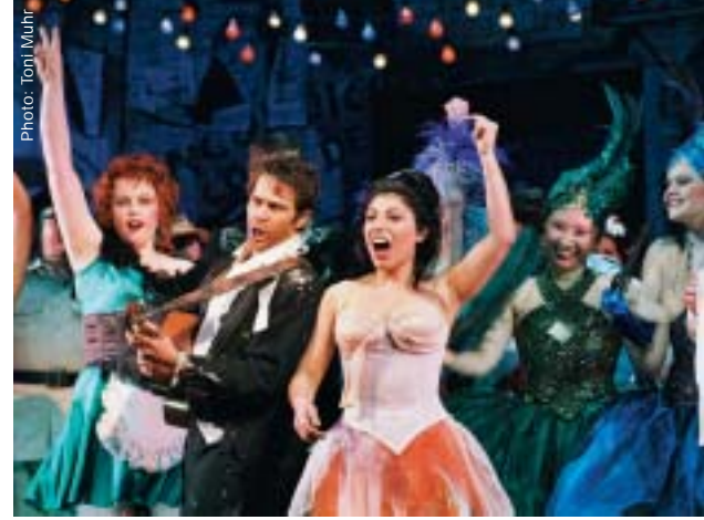
La Périchole at Graz Opera, Helmut Lohner dir.