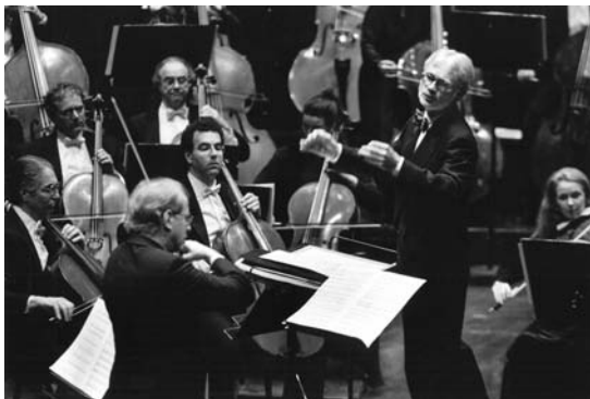
Above: Conducting Piazzolla arrangement New York Philharmonic/Gidon Kremer, violin