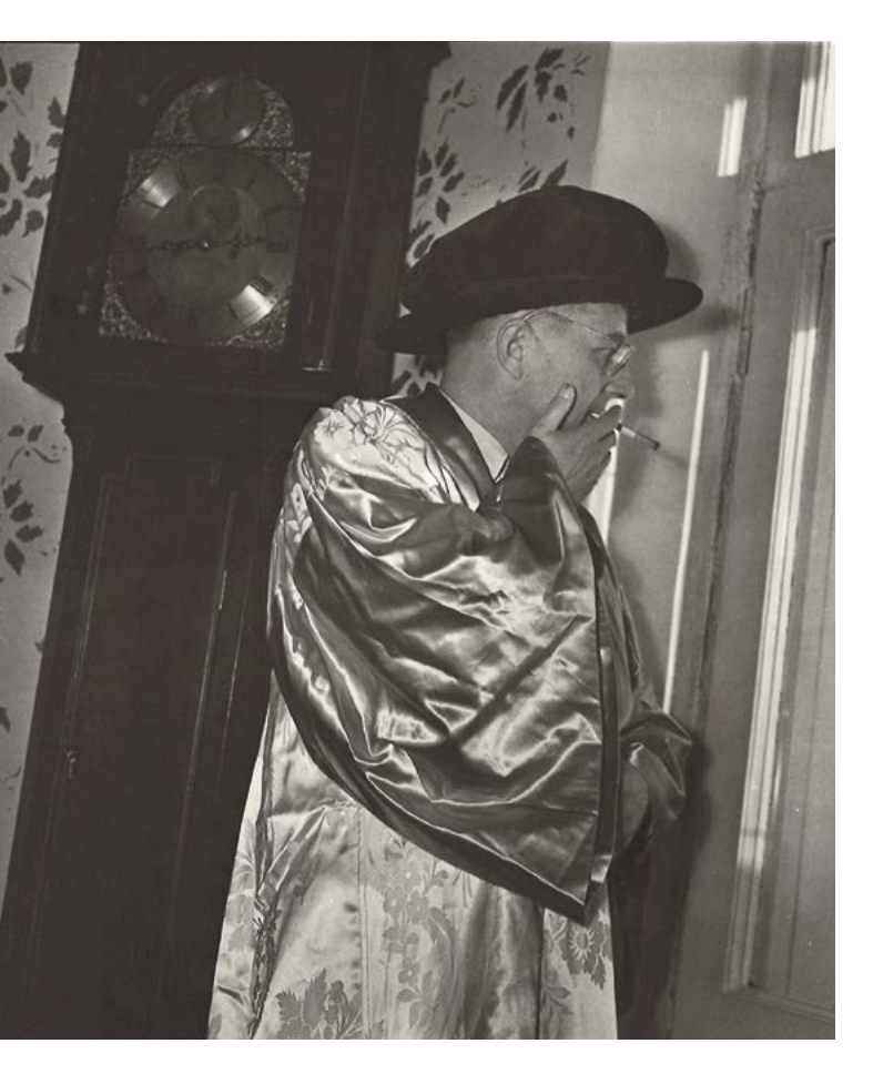
Wearing his Oxford robes, 1958