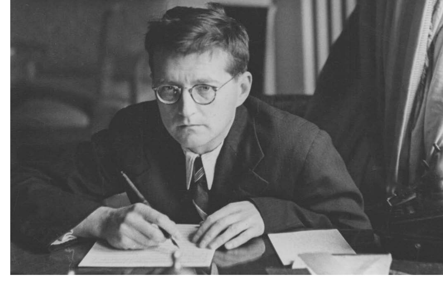
At his work desk in Moscow, 1947