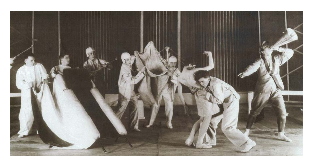
Scene from The Bedbug, costumes and set by Alexander Rodchenko, 1929

The young Shostakovich wrote a number of scores for political theatre pieces, often for performance by amateurs. In this piece, the subject is apparently the class struggle in the despicable capitalistic West (to judge by the title, presumably in Great Britain). The five buoyant movements that have survived resemble the colourful political posters of the time. They are composed for small orchestra and include a simple choral movement that contributes two well-known revolutionary songs, including The Internationale .