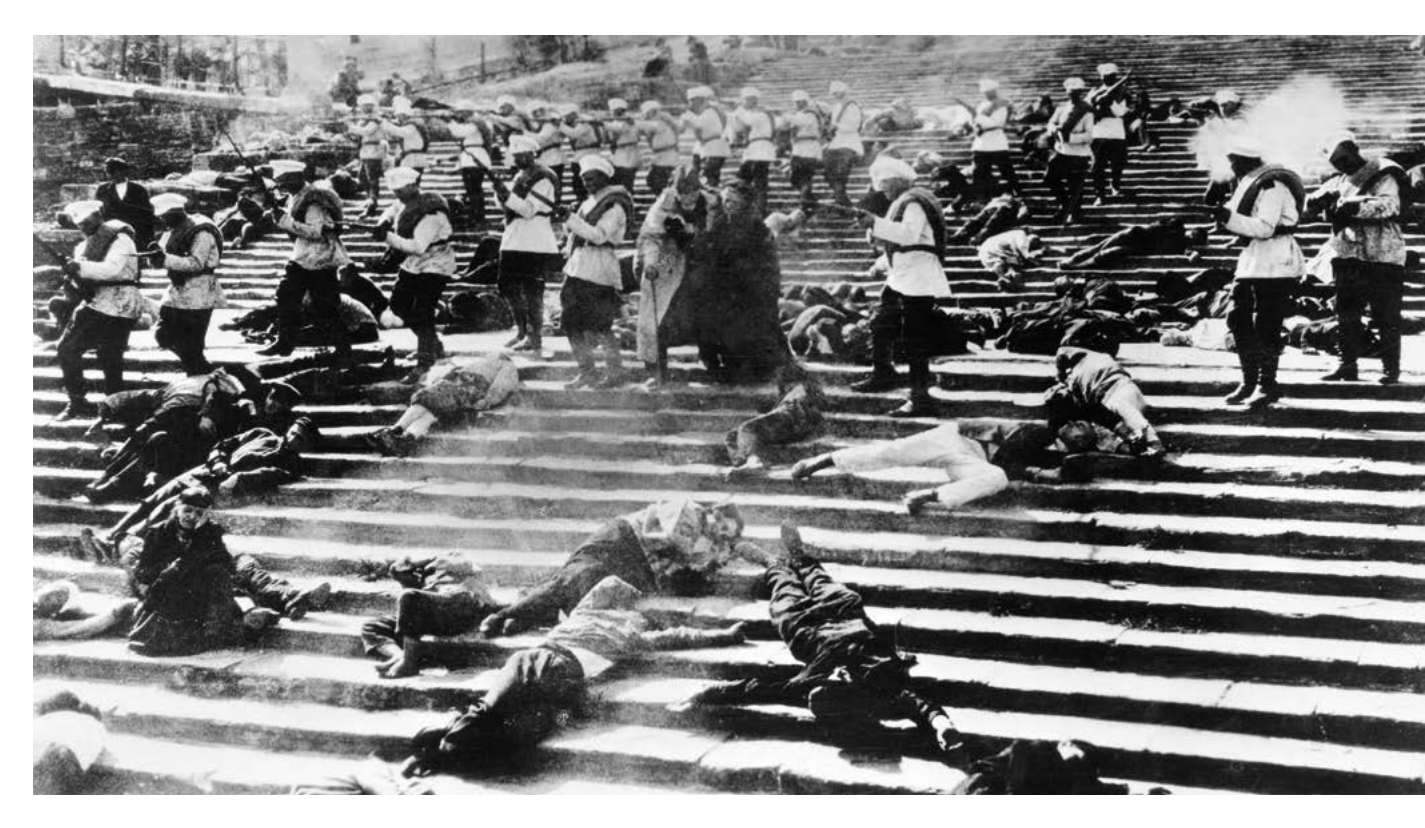
Shot from Battleship Potemkin, 1925