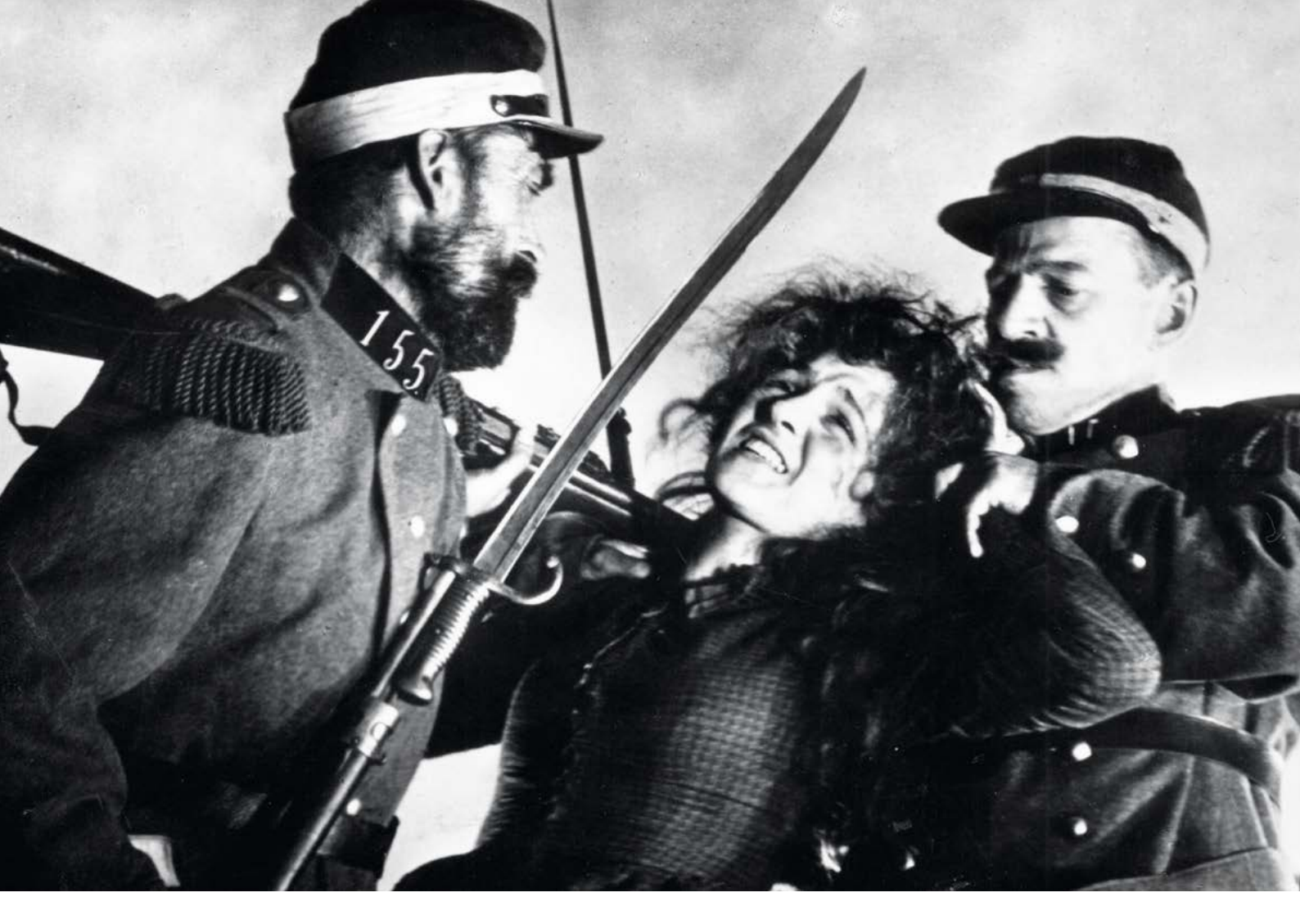
Shot from New Babylon, 1929