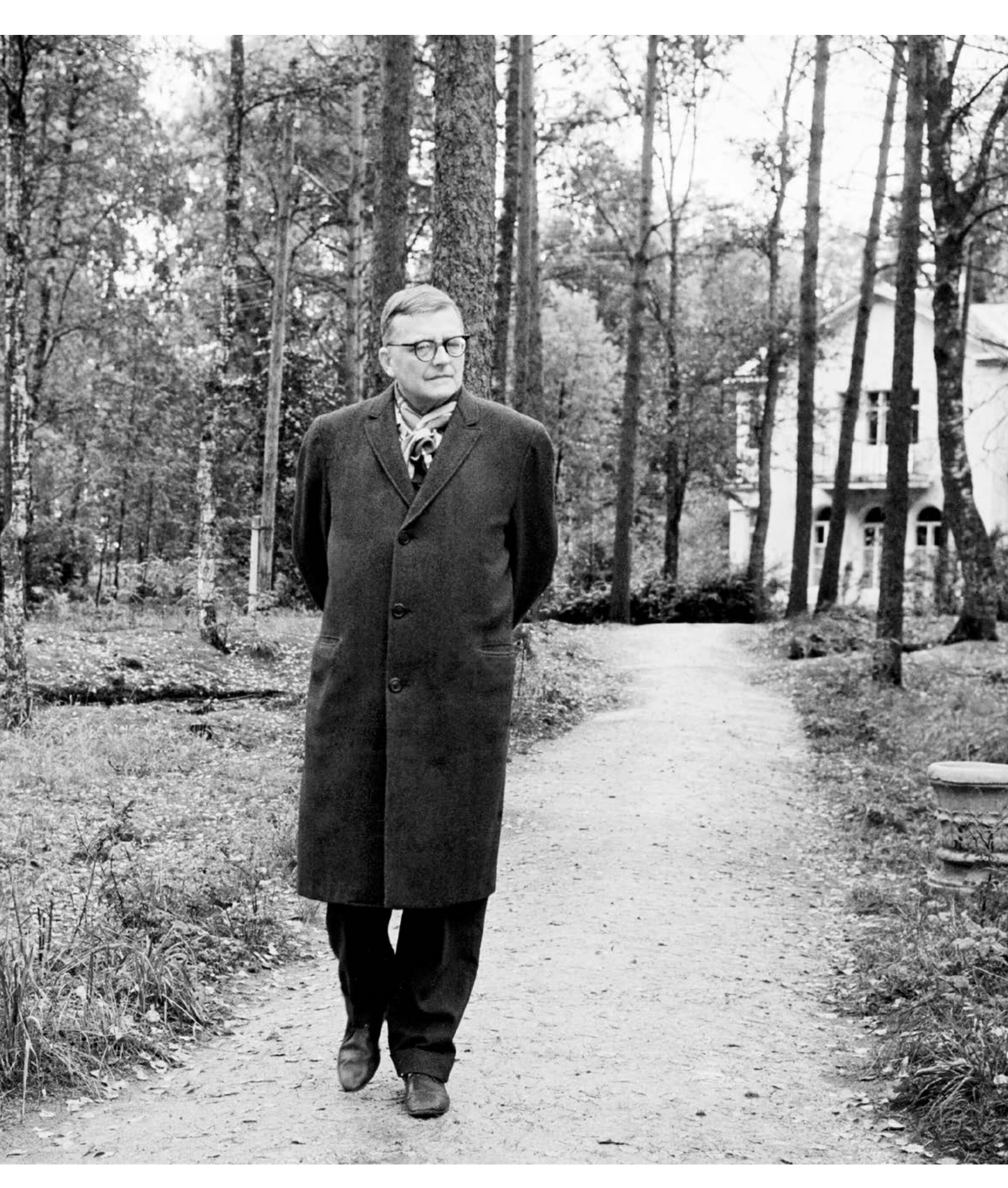
Near Leningrad, 1963